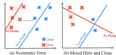
Figure 1: (a) Systematic corruption in one variable (axes) can lead to a shifted model (fitted lines). (b) Mixed dirty and clean data results in a less accurate model than no cleaning.

To highlight the importance of data cleaning in modern ML pipelines, we have noted the choice of data cleaning algorithm can